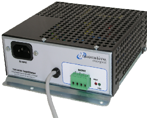
Fast and Safe Recharging for lead acid batteries