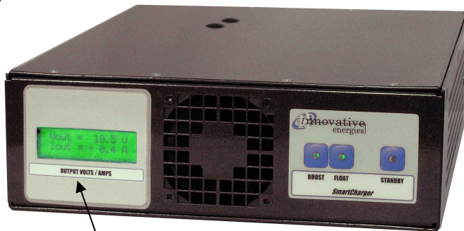
Optional V/I meter shown