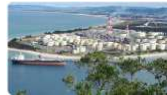
Marsden Point Refinery—Whangarei

These charging systems are used to supply battery backed 30 Volt DC power to the trip coils of 11kV and 3.3kV circuit breakers and the protection relays within the many electrical substations local to the oil refinery. The refinery supplies all of New Zealand's jet fuel, nearly 80% of its diesel and around half of all petrol produced in New Zealand. Also included within each unit were battery condition test and low voltage disconnect functionality, ensuring that the backup power supplies are always ready to go when needed.